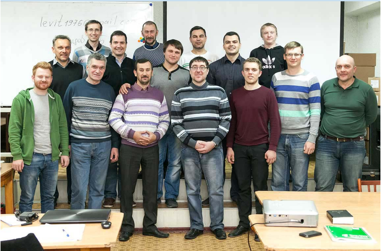
Session in Nizhny Novgorod