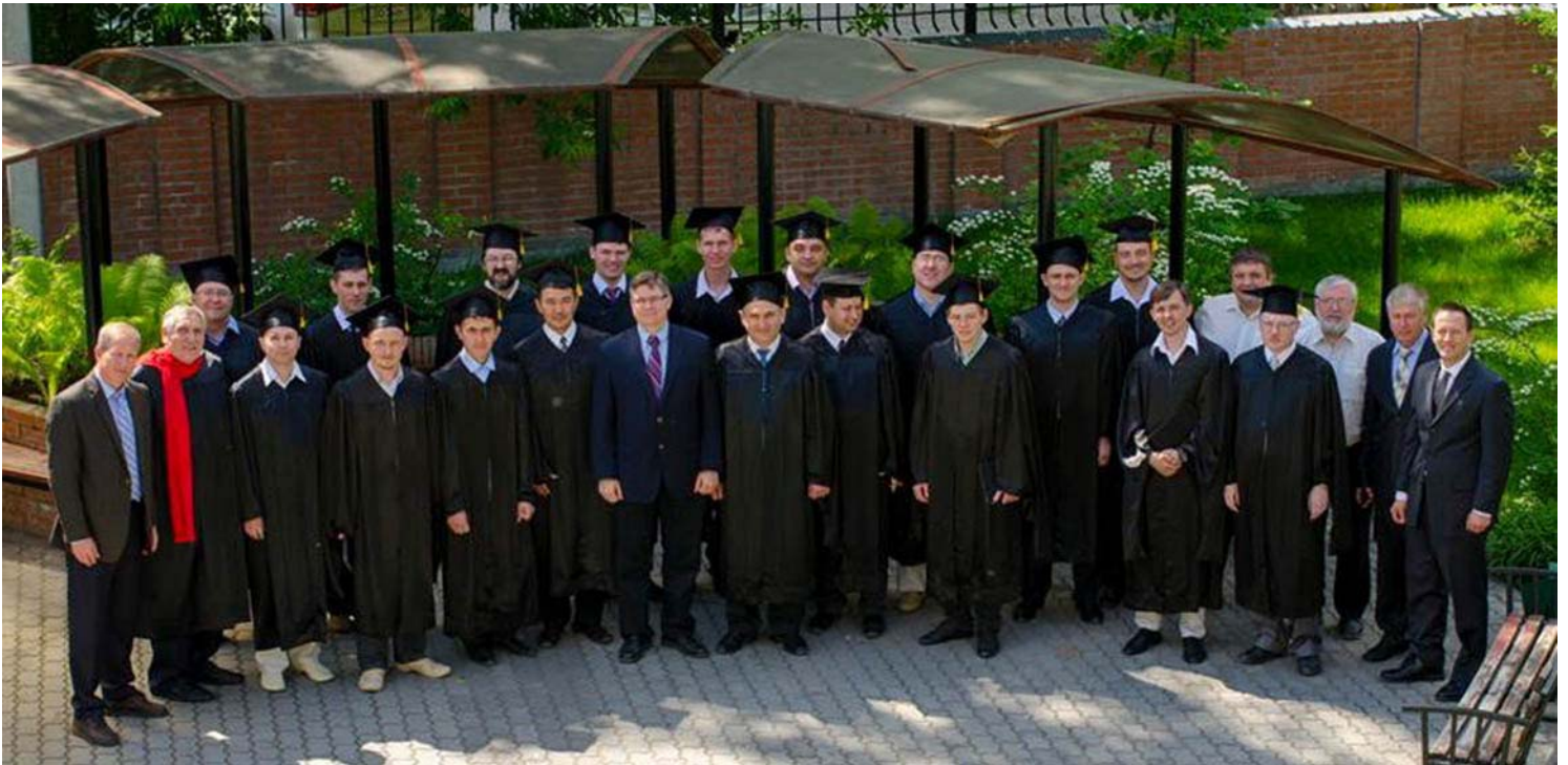
Graduation 2015 of the distant program